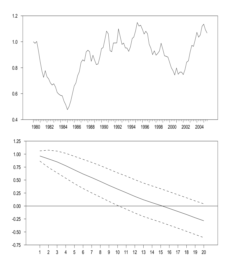
Figure 2. Real exchange rate between the euro area and the U. S. (top panel) and its autocorrelation function (bottom panel)